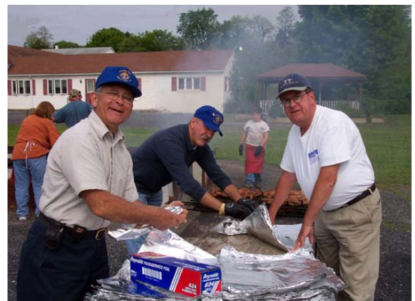
A TYPICAL CHICKEN SALE WRAPPING SESSION